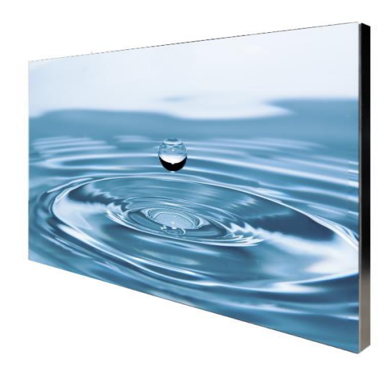
MW7718-MI-H1C Indoor LED Display Module