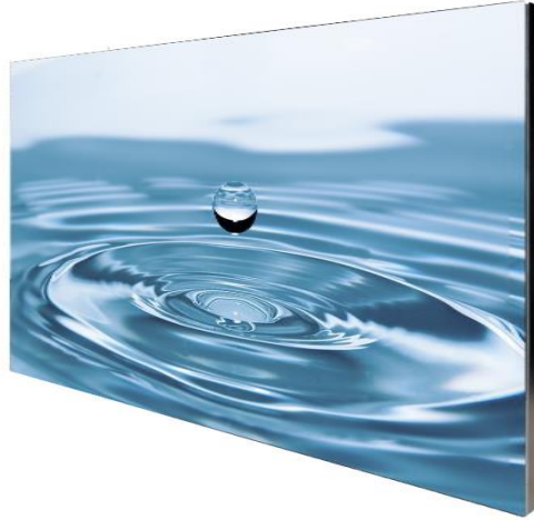
MW7712-MI-H1C Indoor LED Display Module